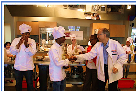
Comprehensive After School System of New York City (COMPASS)