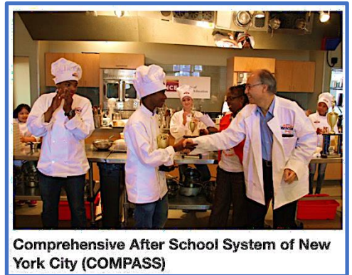
Comprehensive After School System of New York City (COMPASS)